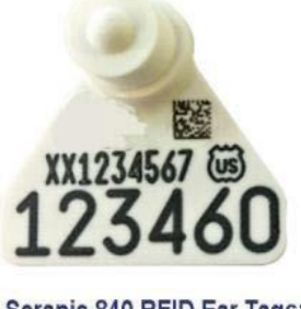
Plastic Flock ID Tags: